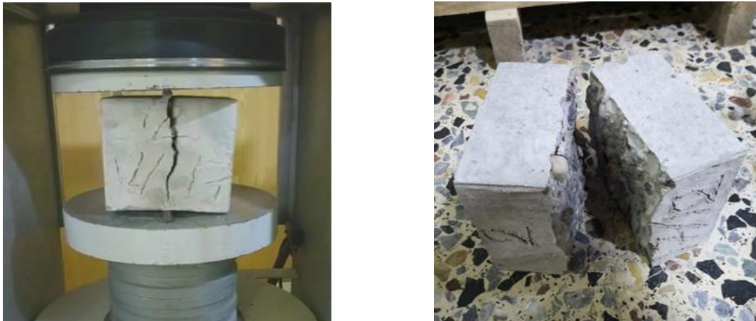
Figure 2: Method of bisection of a cube

Pressure tested according to BS 1881-116. (Using 150 mm cube samples) [14]. Single samples were loaded by a compacting machine (2000 kN Automatic Concrete Compactor, Liya Corporation) with a capacity of 2000 kN with a loading rate of 2.5 kN / s. All samples were tested at the same loading rate, and the rate was taken for every three cubes examined each time.