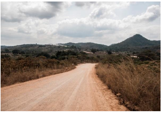
Figure 2: An image showing the road network in the research study area, Kayelekera village Source: Wikipedia the free encyclopedia, Photo by Jessie Boylan taken near Kayelekera, Malawi.

significant negative effects on adjacent habitats, wildlife populations, communities, and ecosystem [6]. In Karonga and Chitipa coming up of the kayelekera mining came with a package of more road networks for easy accessibility to the mine and this caused more deforestation and degradation of the landscape through perforation, dissection. The image 2 and 3 below illustrates some of the landscape changes that have taken place in the Kayelekera landscapeeg the construction of various road networks. Hence development is somewhat responsible for the current unprecedented rate of biodiversity loss, pollution, fragmentation, and degradation of habitat across the landscape [7].