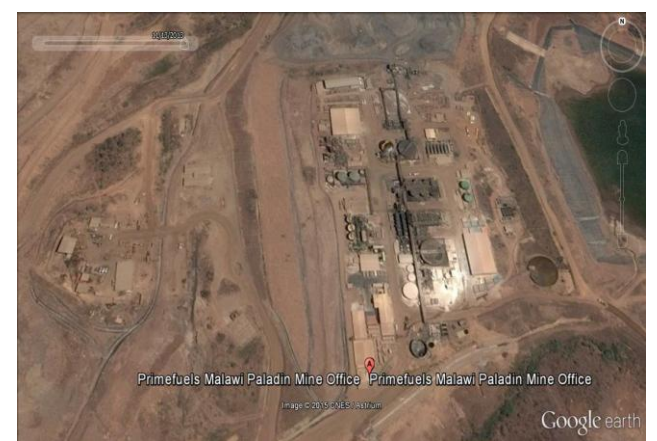
Figure 5: A satellite image showing the view of Kayelekera 6 years After the mining in 2015