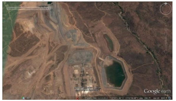
Figure 3: A satellite image showing the road network for Kayelekera