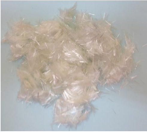
Figure 1: Polypropylene fiber

Fiber reinforced: using Polypropylene fiber. Photos of this fiber and some specific technical characteristics are shown in Figure 1 and Table 2.