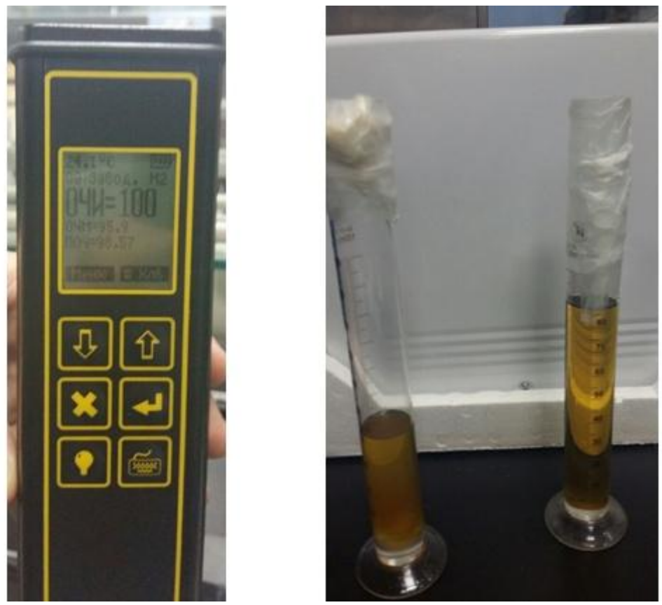
Figure 4: Photographs of the extracted high quality diesel fractions