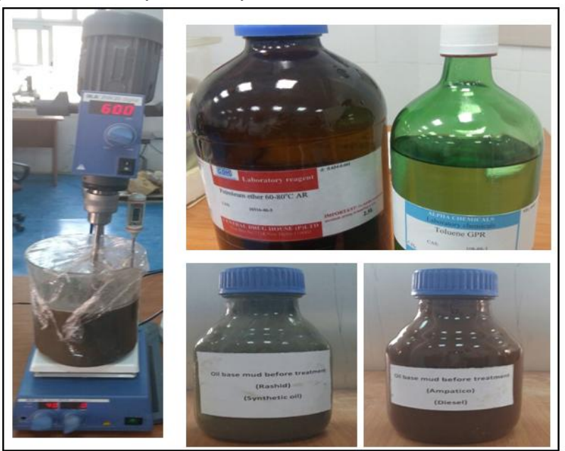
Figure 1: Photographs of a stirring system, solvents and contaminated cuttings

As shown in Table 1, the distillation of Rashid sample has an initial boiling point 140 °C and final boiling point 249 °C with a high quality fuel of gasoline and kerosene that has 100 RON and 95.9 MON. Moreover, the recovery of distillation is 98% and thus the squeezed cuttings has 2% by volume of contaminated fuel. In addition, the cuttings can be used safely without any adverse effects on the environment.