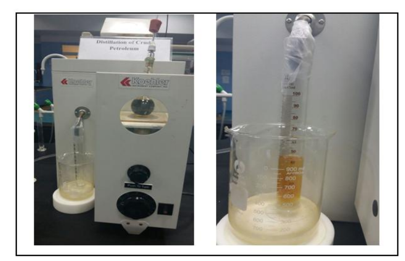
Figure 2: Photographs of ASTM distillation unit with receiving products