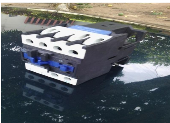
Plate 3: Contactor