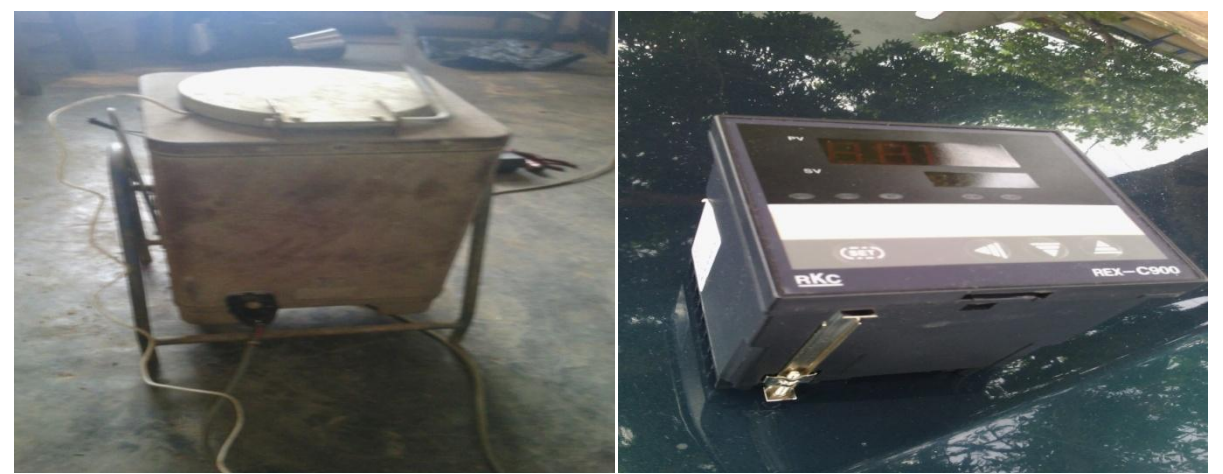
Plate 1: The Induction Furnace