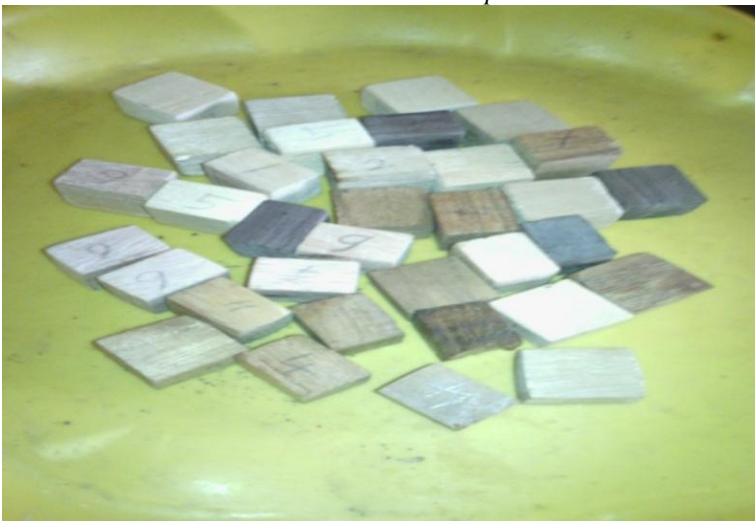
Plate 5: Samples of the wood species

Woods that are commonly used in building construction and that are locally available in South-Western Nigeria were investigated in this study. Table 1 shows the different species of wood that were investigated. Samples of the wood species (Plate 5) were sun dried to a constant mass. Five samples of each specimen were