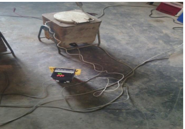
Plate4: Connection of the thermocouple, temperature controller and the contactor