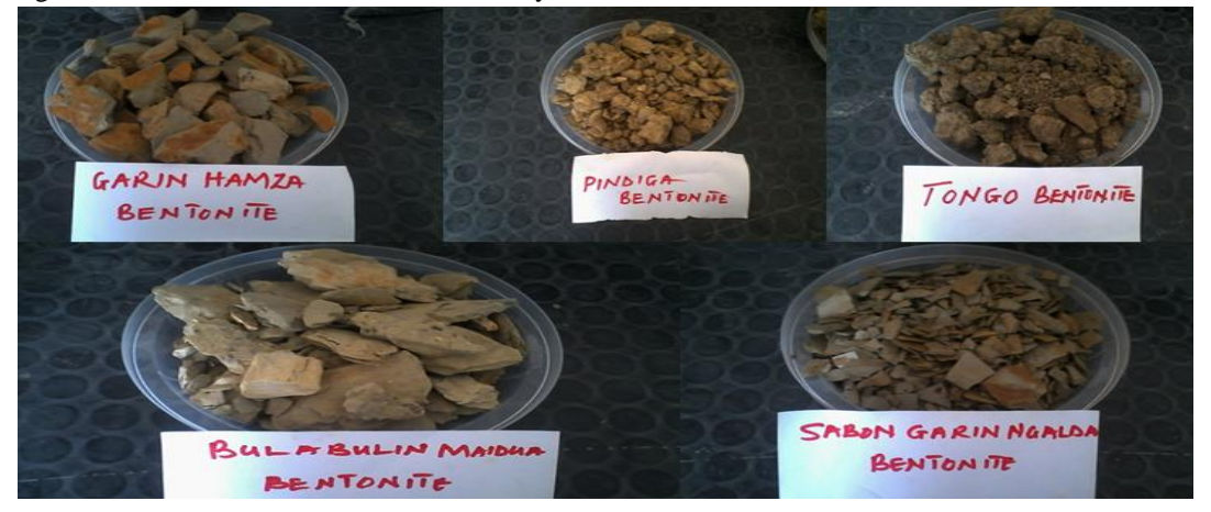
Plate I: Morphological features of raw bentonitic clays as collected from the field.

The colour of all the collected samples of bentonite is generally light grey with brown stains on Garin Hamza, BulabulinMaiduwa and SabongarinNgalda. Green and Yellow pigments were also observed on Pindiga Bentonite. The brown pigments could be iron impurities while green could be organic matter and the yellow pigments could be sulphur from the decomposed fossils deposited at the time of deposition of the sediments. It was observed that Tongo sample is the darkest of all the samples probably due to the presence of ferromagnesian minerals in the sediments as clearly shown in Plate I.